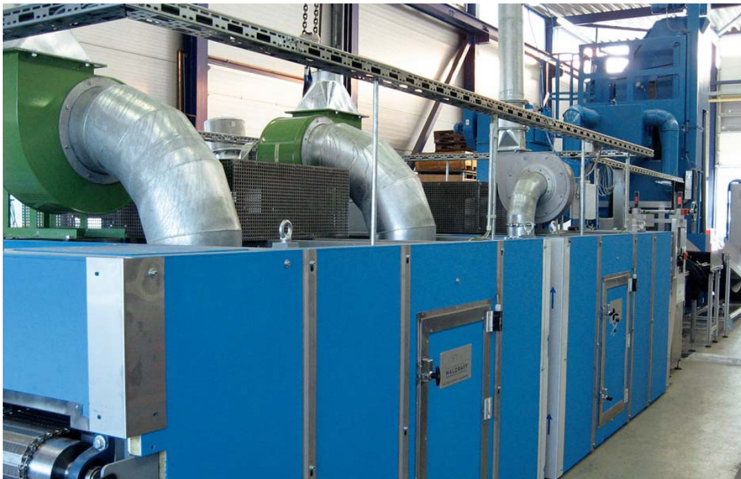
Furnace with composite elements

The properties mentioned are typical values obtained according to the listed methods. Product variations have to be taken into account. The data do not represent guaranteed properties and cannot be used for any warranty claim. Data are subject to technical modifications.